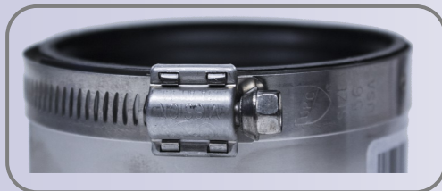
300 Series All Stainless Adjustable Band