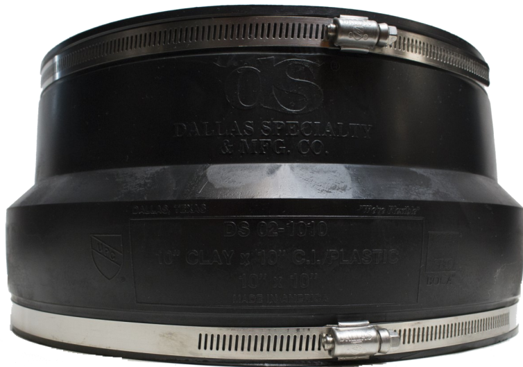
Part shown may not be actual part, for reference only

Part accommodates pipe od's: 12" Clay Pipe to 12" CI/PVC Pipe Coupling is made of Flexible PVC with maximum flexibility (+/- 5% OD)