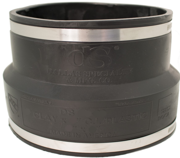
Picture may not be exact part, may be only for example of similar part

Cast Iron, SDR35, Plastic, Service Weight, No-Hub, Stainless Steel, XHCl, ABS and other piping systems with similar pipe OD's. See sizing chart for our extensive line of sizes available.