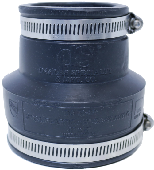
Part shown may not be actual part, for reference only

FITS: 2" PLASTIC or Socket Pipe x 2" CAST IRON/PVC PIPE