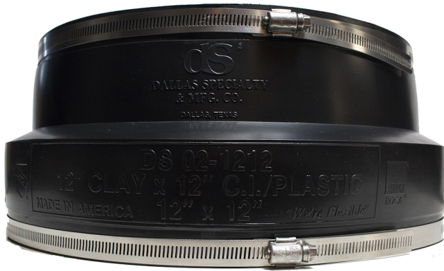
Part pictured may not be actual coupling, but similar. For reference only

FITS: 15" ADS/Corrugated Pipe x 15" CI/PVC Pipe Coupling accommodates size range 17.25" - 18.25" Pipe OD's x 14.90" - 15.90" Pipe OD's