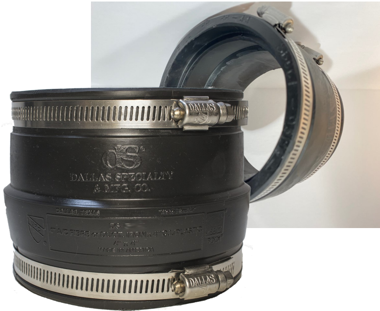
Part pictured may not be actual coupling, picture for reference only