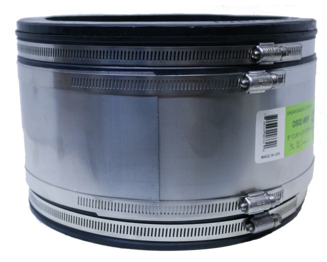
Coupling pictured may not be actual coupling, but similar. For reference only