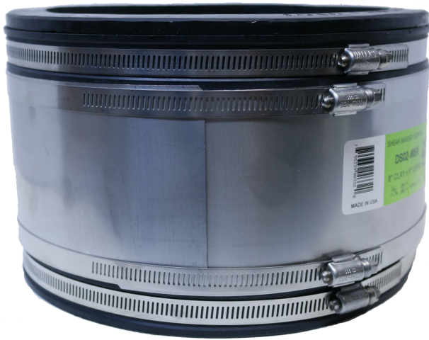
Coupling pictured may not be actual coupling, but similar. For reference only

Dallas Specialty PVC Sewer Pipe Couplings have a +/-5% to the Pipe OD in which it is designed to accommodate, allowing for a range of flexibility to tighten down and/or stretch up where needed to accommodate many pipe size connections. If coupling is assembled with flexible pvc bushings this may only allow for 2-3% stretching up or tightening down in some couplings