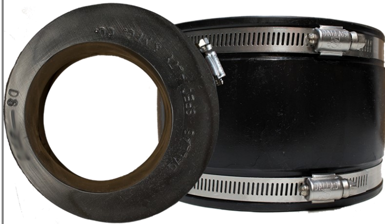
Part shown may or may not be actual part, picture for reference only