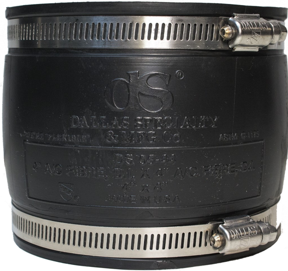
Part pictured may not be actual coupling, picture for reference only

Accommodates pipe size range 4.55"-4.89" pipe od's x 4.55"-4.89" Pipe OD's